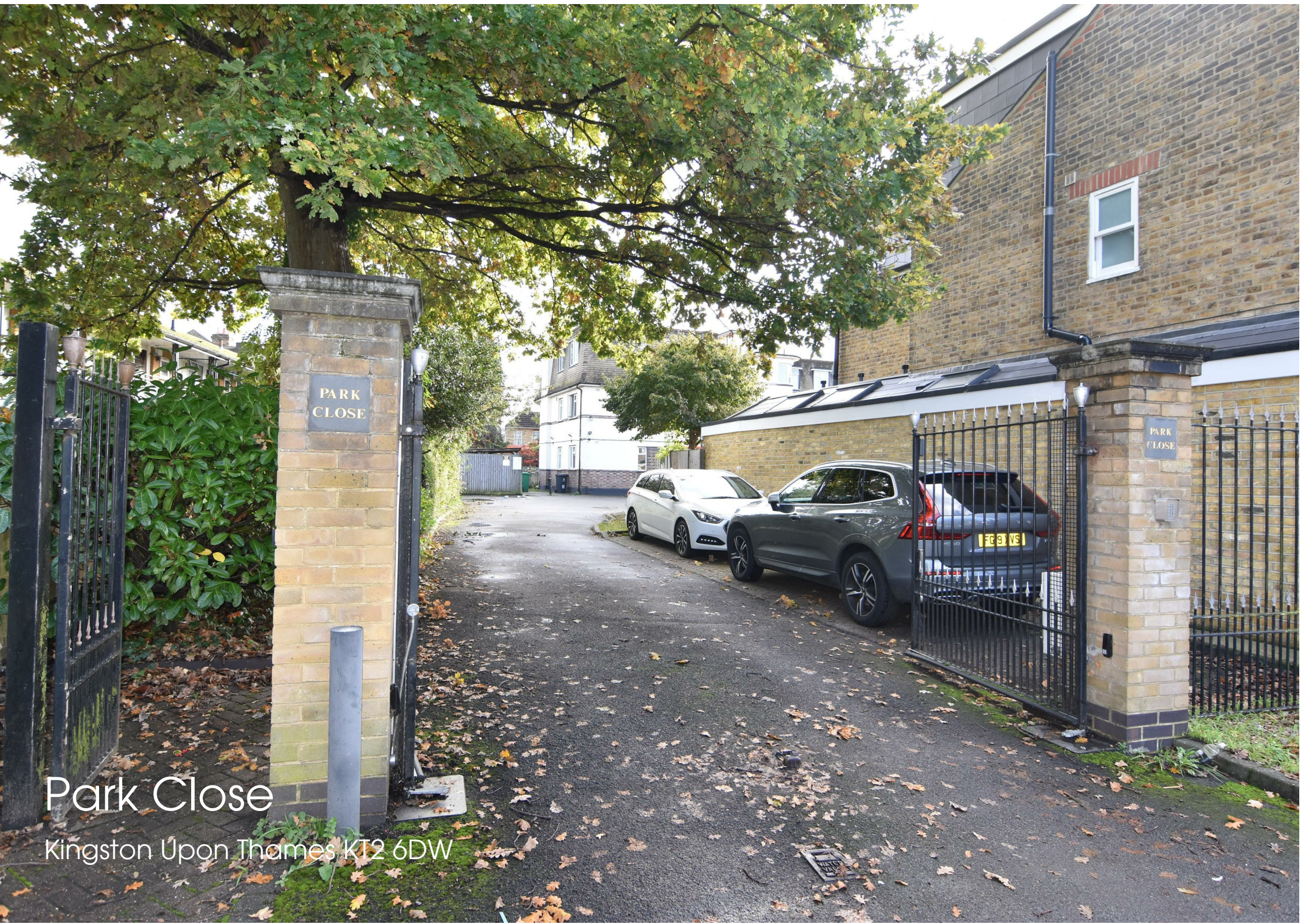
Park Close Kingston Upon Thames KT2 6DW